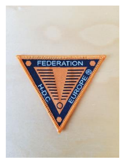
The patches are woven! Price 1.00 Euro / piece

Place your order to: treasurer@fhdce.eu (only for Clubs)