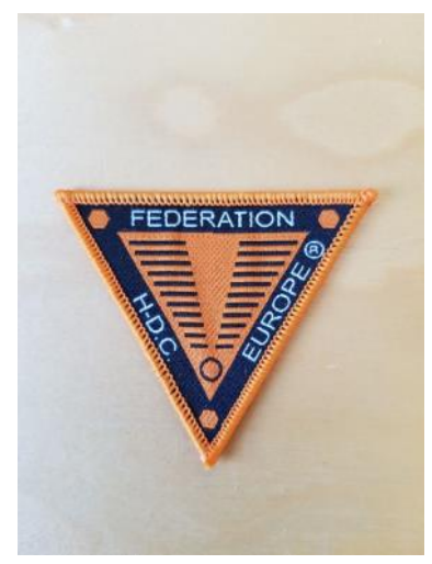
The patches are woven! Price 1.00 Euro / piece

Place your order to: <a href="mailto:treasurer@fhdce.eu">treasurer@fhdce.eu</a> (only for Clubs)